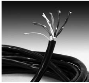
Opticom™ Model 138 Detector Cable