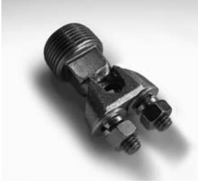
Opticom™ Span Wire Clamp